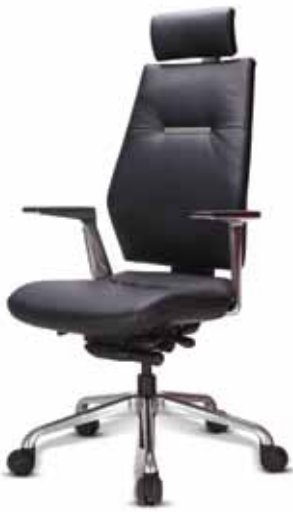
High Back with Headrest

The SEDNA range of ergonomic chairs can easily be looked upon as thrones of power. Crafted from the finest leather, these chairs are ideally suited for high-powered corporates. They offer comfort of the highest degree and are designed for long hours of seating. Each chair has the most advanced ergonomics, with even the minutest detail perfected to exacting Italian design standards.